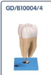
Lower Incisor with two Roots