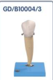
Lower Molar with One Root