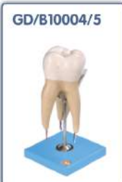
Lower First Upper Molar with Three Roots